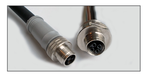
Brad® M12 Power Connectors (4-pin connector and receptacle shown)

Connectors and Receptacles 2 to 4 Pins Plus PE Ground Pin (up to 630V, 12.0A)