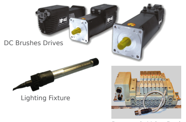
Pneumatic Valve Bank

Note: Molex reserves the right to delay or cancel production of the depicted product without additional notice. Please contact your Molex customer service representative for product availability.